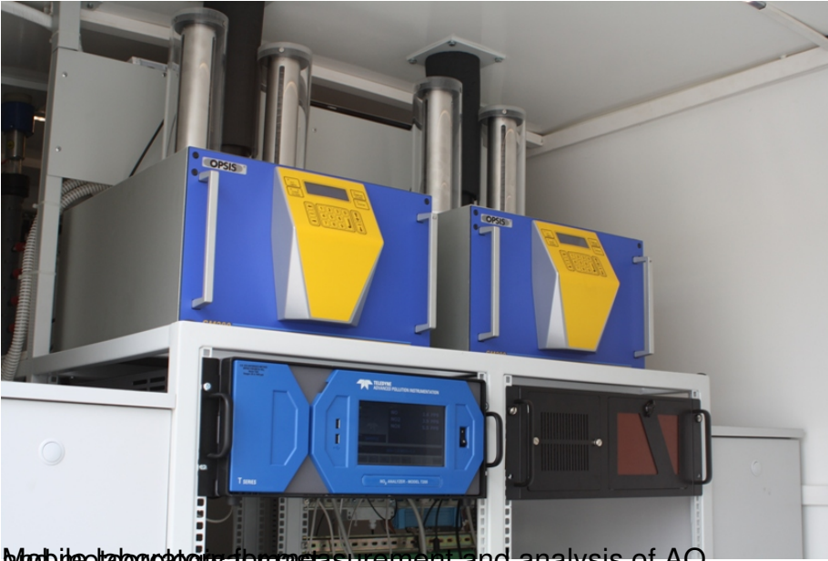
Multi-point monitoring for measurement and analysis of AQ

Friday, 08 November 2013 09:23 - Last Updated Thursday, 18 June 2015 17:37