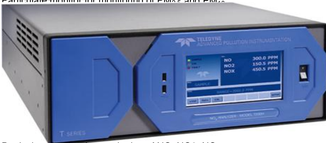
Particulate monitor for monitoring of NO, NO2, NOx