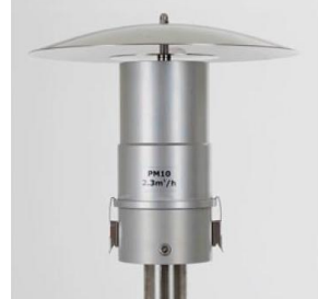
Particulate monitor for monitoring of PM 10 and PM 2.5